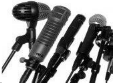
Stay on message