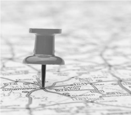
All politics is local