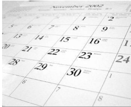
Make an Appointment