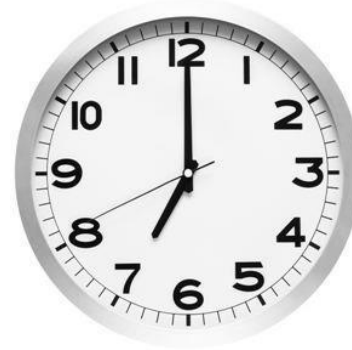
Never be late