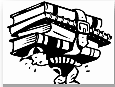
Do your Homework